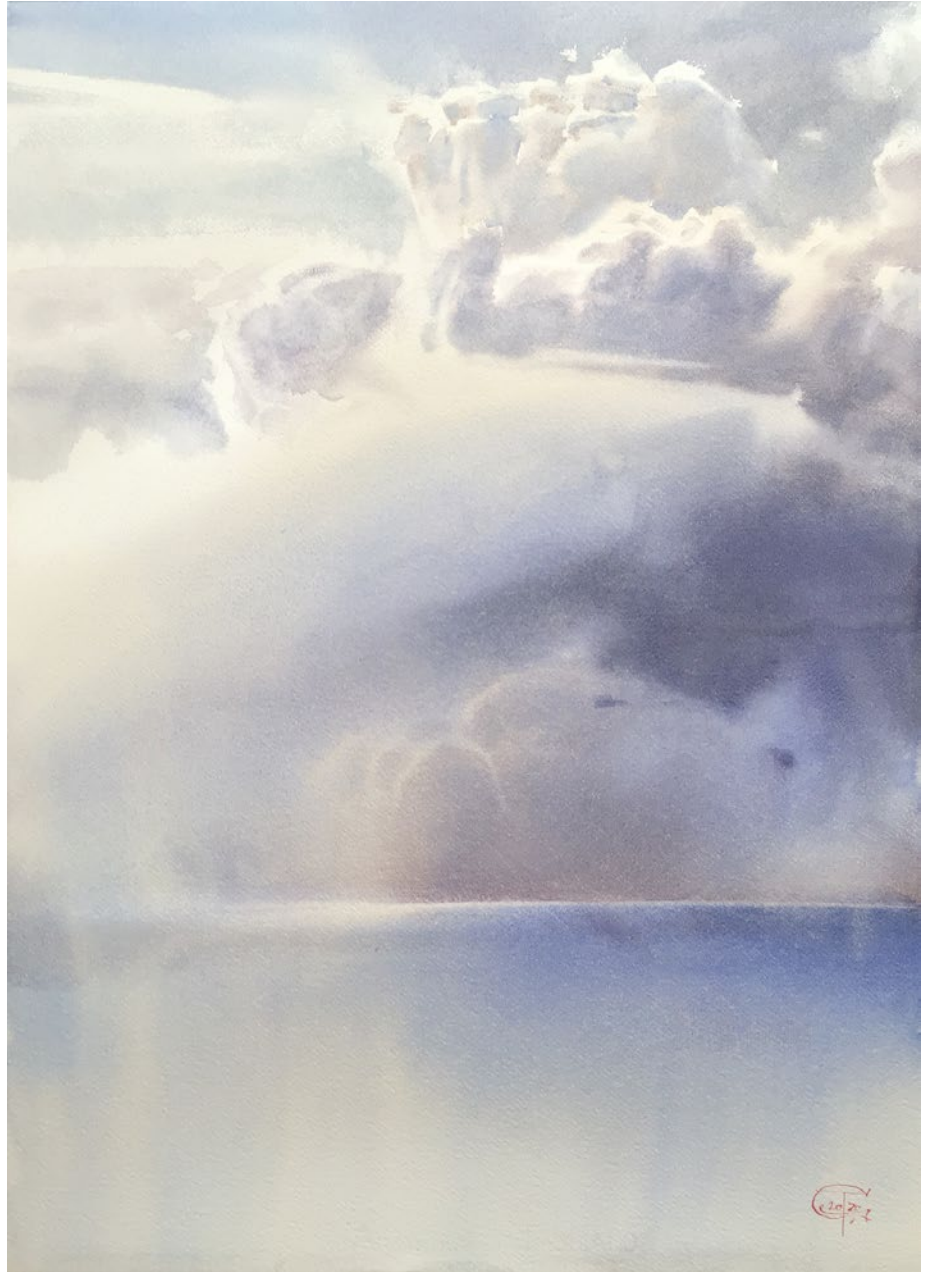
The noon time sunny haze. Watercolor on paper. 76 x 56 cm. 2020.