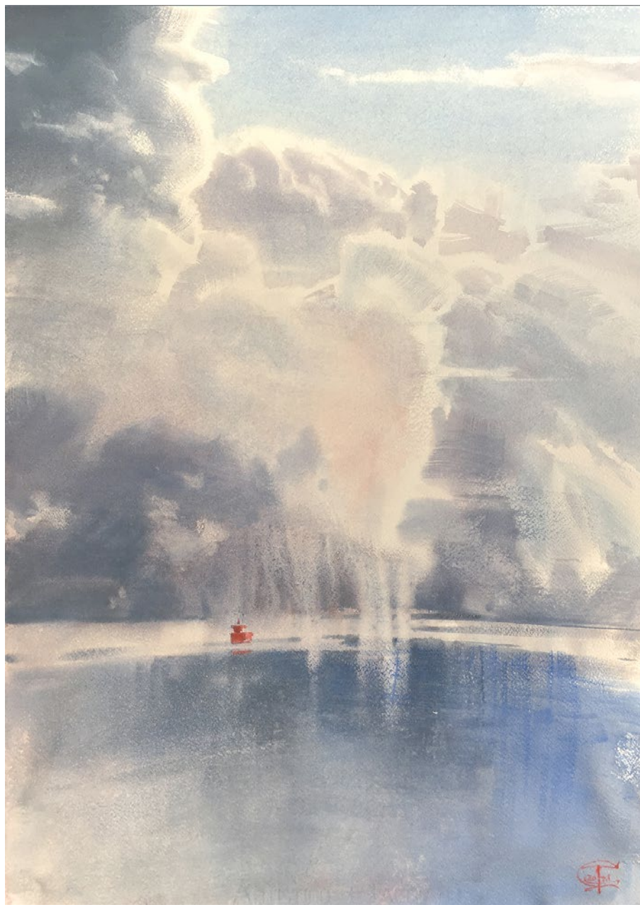
A short downpour under the blinding Sun. Watercolor on paper. 69 x 49 cm. 2021