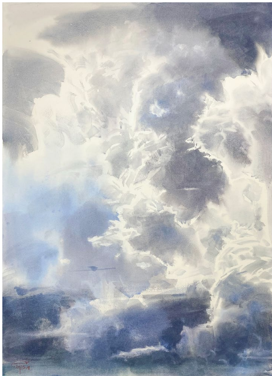
Heavenly Scapes. Series III. Opus XXIII-XIII. Watercolor on paper. 76 x 56 cm. 2023