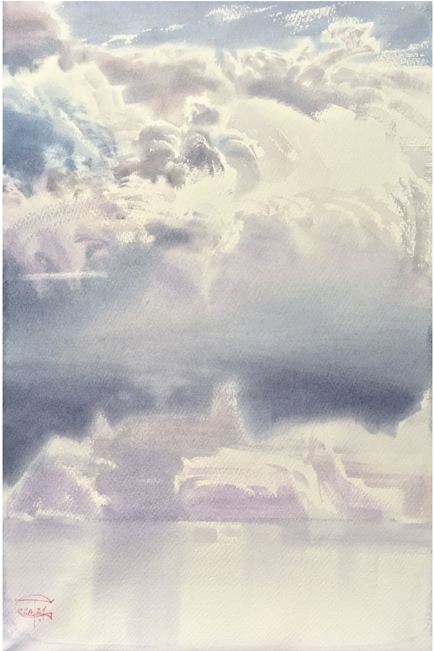
Sun, clouds, and wind. Watercolor on paper. 56,5 x 38 cm. 2021