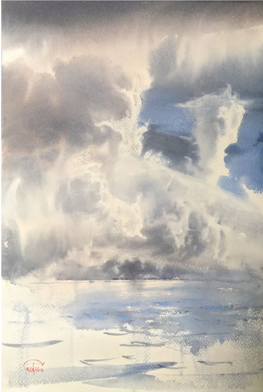
The shine of cloudy walls and towers. Watercolor on paper. 56 x 38 cm. 2021