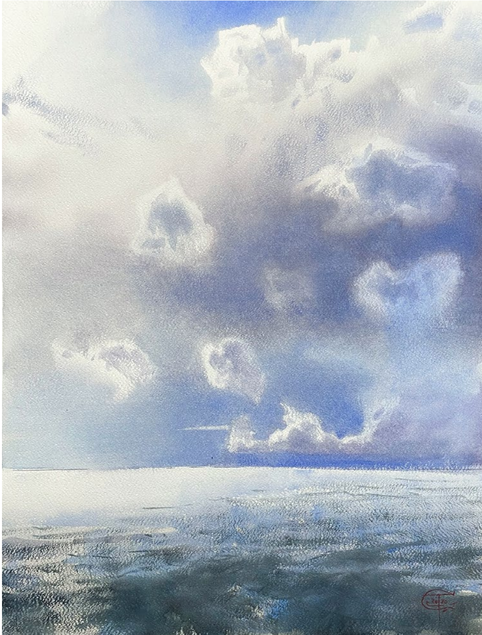
A cool breath of wind. Watercolor on paper. 61 x 46,5 cm. 2020