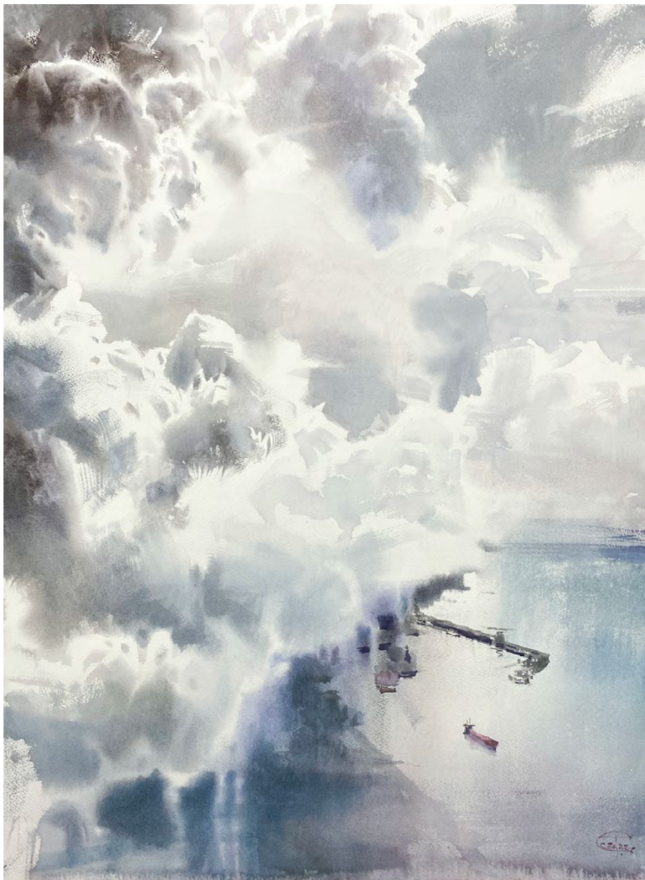
A city, hidden by the shining Heavenly Cover. Variant-II. Watercolor on paper. 76,5 x 56,5 cm. 2022