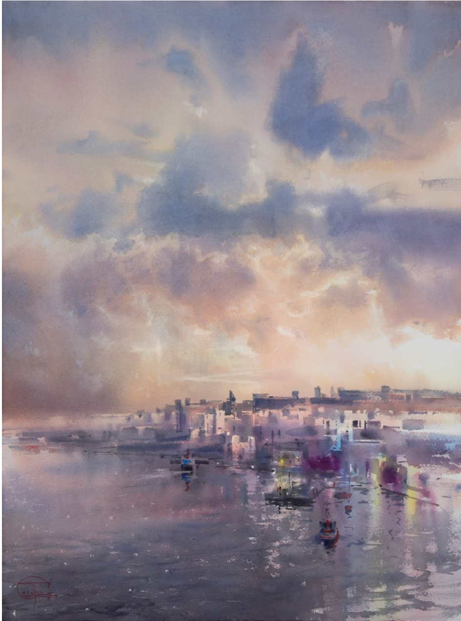
City by the Sea. Evening. Watercolor on paper. 76,7 x 56,6 cm. 2018