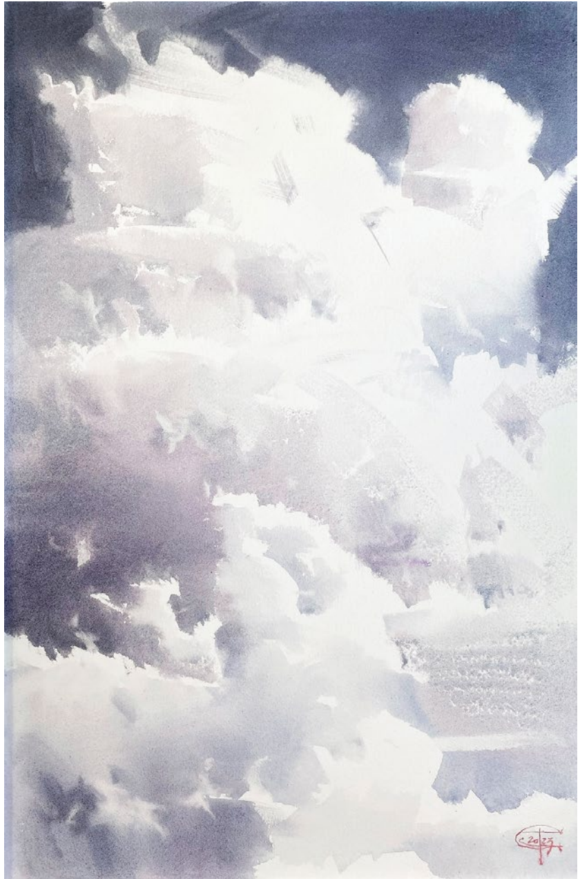
Heavenly Scapes. Series III. Opus XXIII-XV. Watercolor on paper. 56,5 x 38 cm. 2023