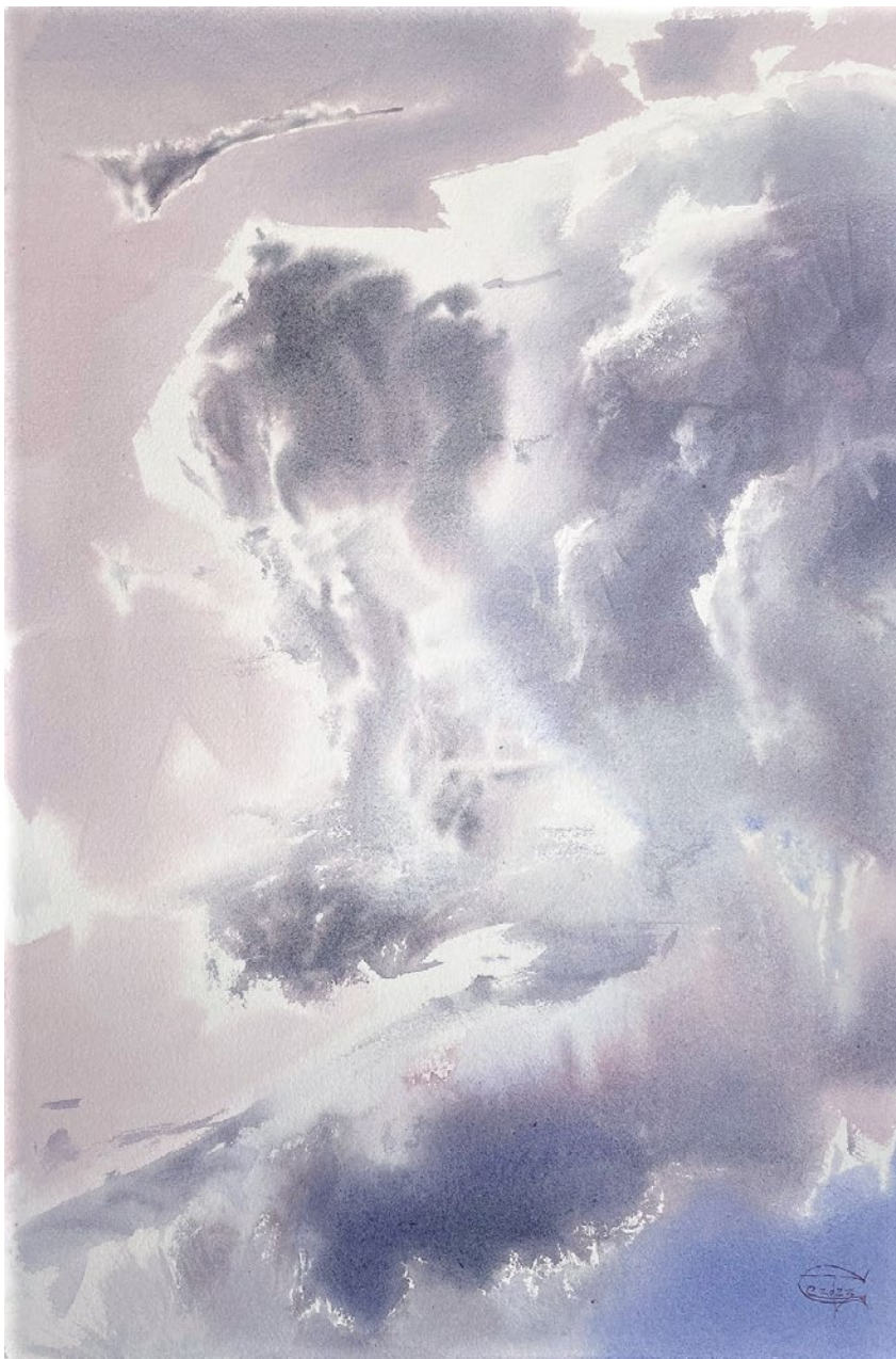
Heavenly Scapes. Series III. Opus XXIII-XIV. Watercolor on paper. 56,5 x 38 cm. 2023