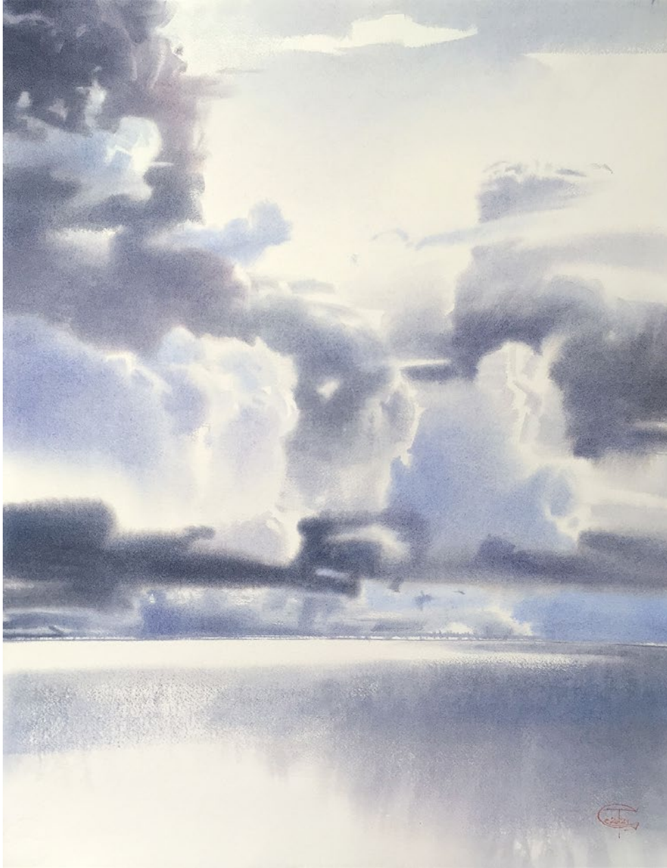
A slow flow of the dark and light clouds. Watercolor on paper. 65,5 x 52 cm. 2021.