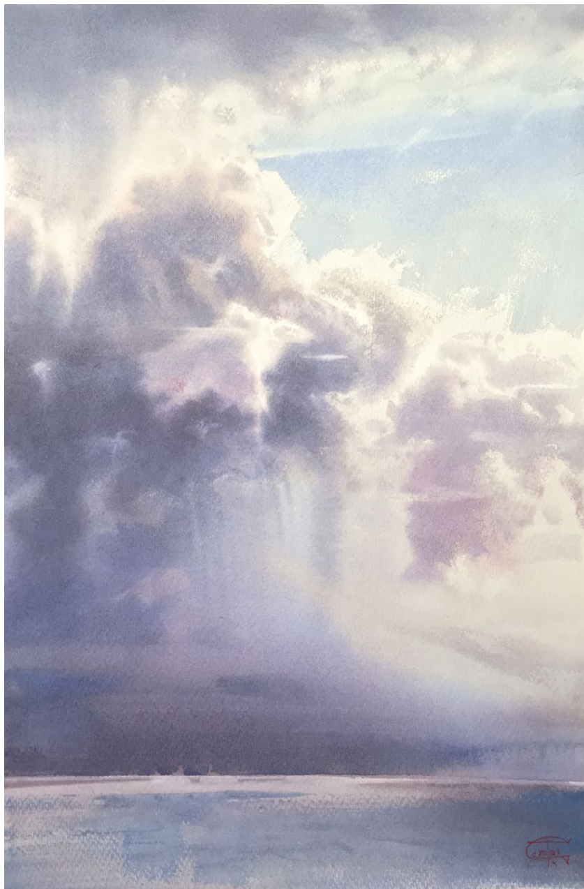
Flows of the rain over the far shore. Watercolor on paper. 56 x 38 cm. 2021