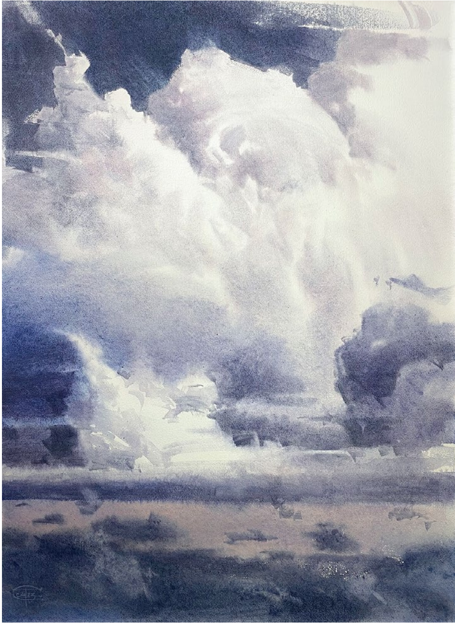
Heavenly Scapes. Series III. Opus XXIII-VIII. Watercolor on paper. 76,5 x 56,5 cm. 2023