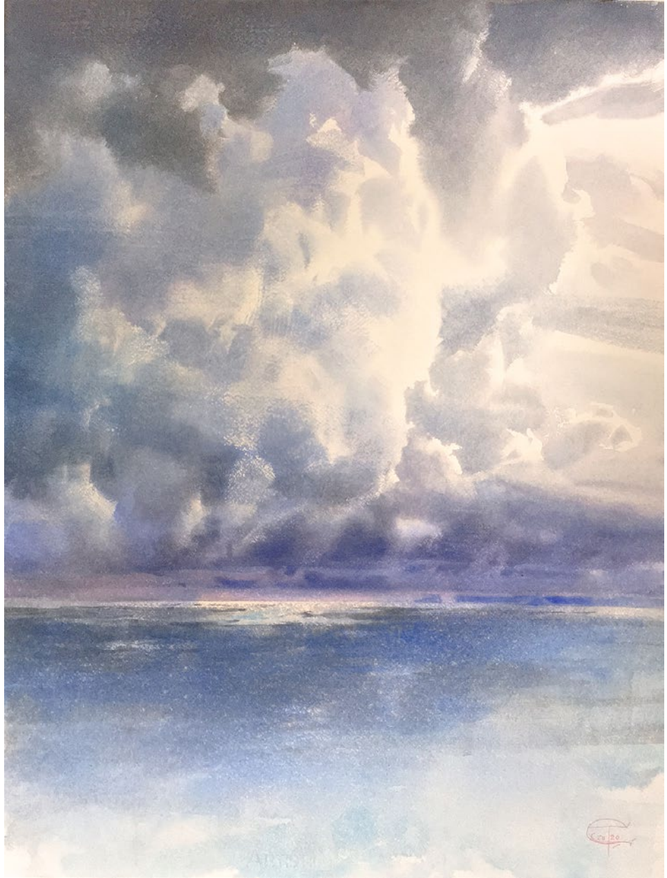
What the rising wind brings. Watercolor on paper. 76,5 x 58 cm. 2020