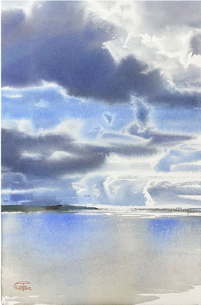
A slow flow of the dark and light clouds - V. Watercolor on paper. 57 x 37,5 cm. 2021