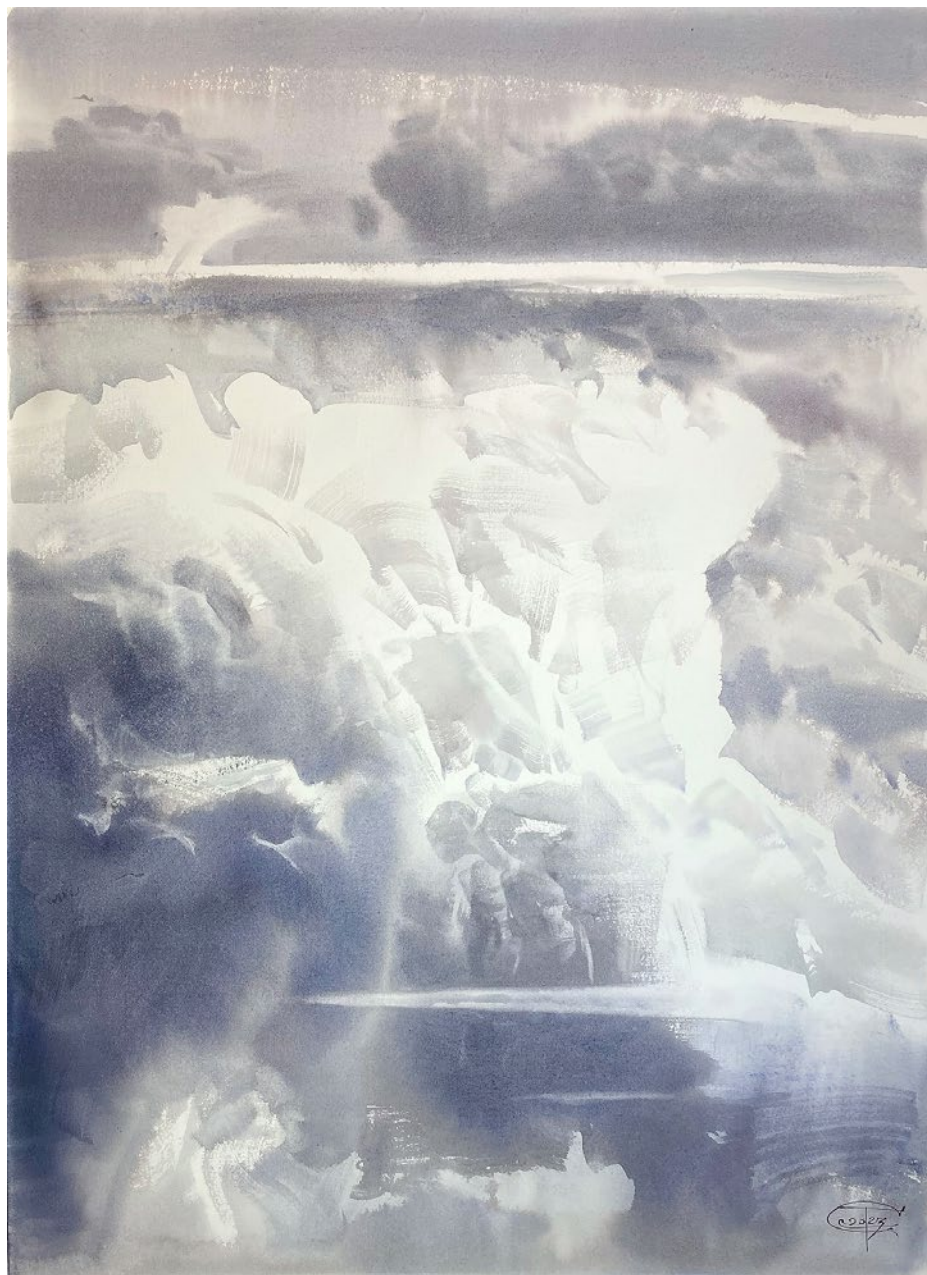
Heavenly Scapes. Series III. Opus XXIII-XI. Watercolor on paper. 75,5 x 55,5 cm. 2023