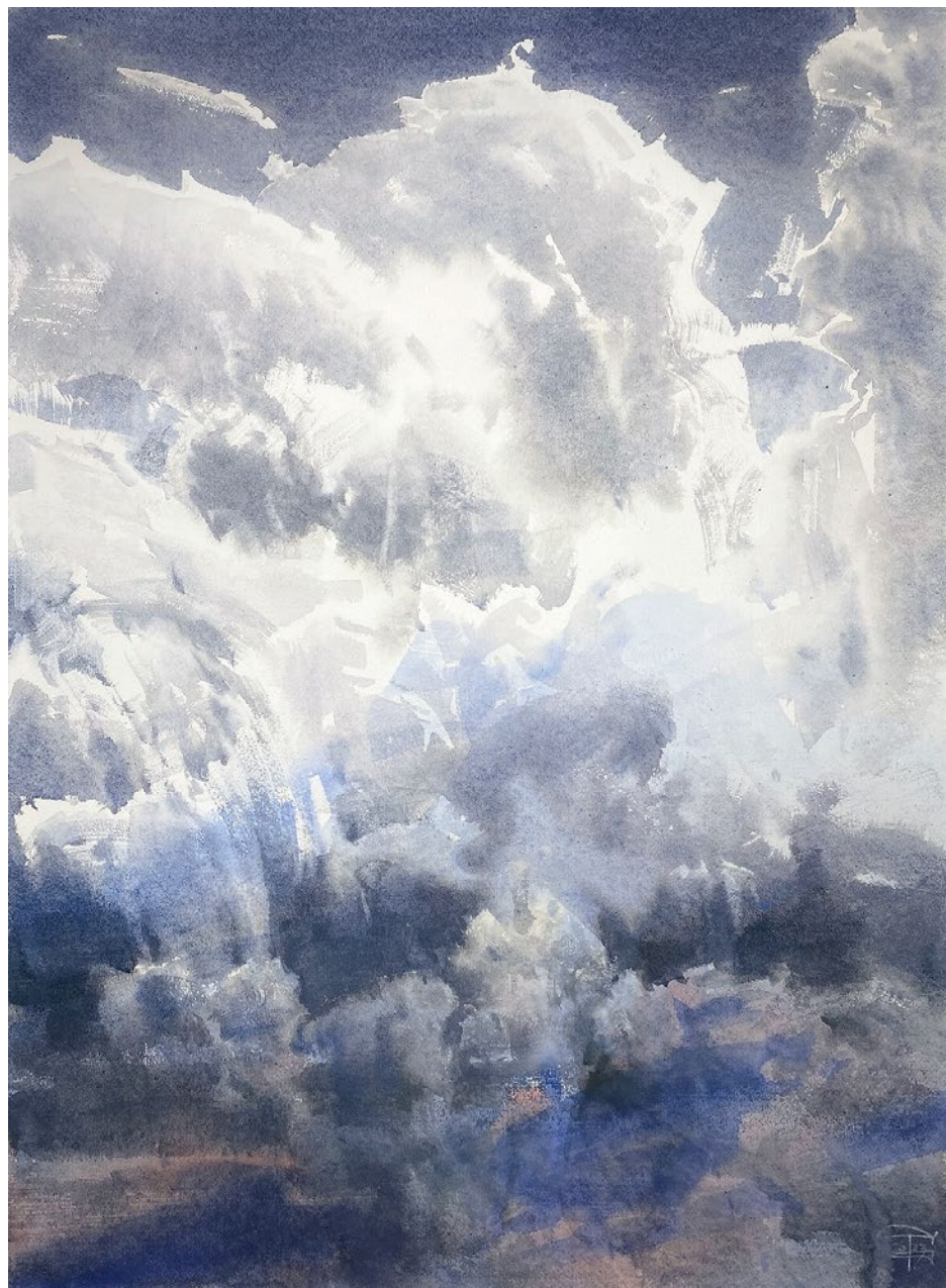
Heavenly Scapes. Series III. Opus XXIII-X. Watercolor on paper. 75,5 x 55,5 cm. 2023