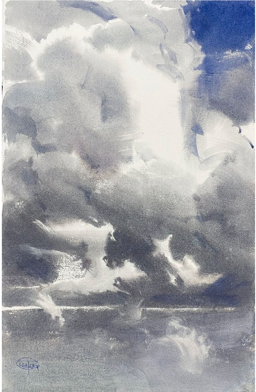
The Runners through the Sky depths – III. Watercolor on paper. 55,5 x 36,5 cm. 2023