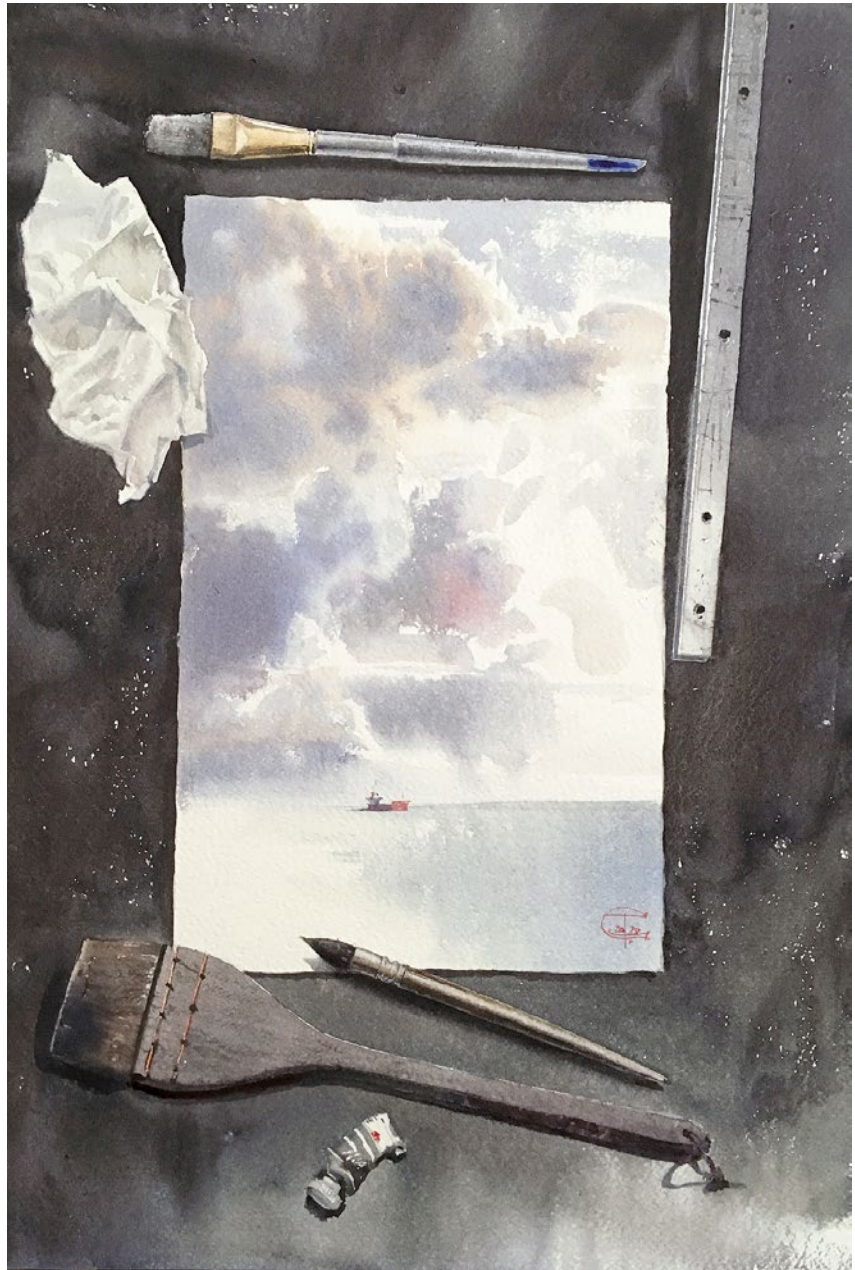
Everything, that is there on the paper - II. Watercolor on paper. 56 x 37,5 cm. 2020