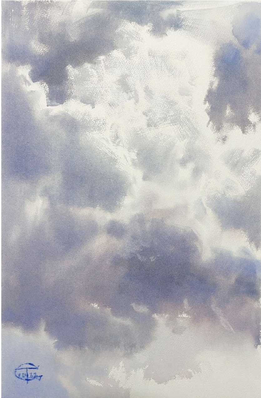
The wind's breath – II. Watercolor on paper. 57 x 38 cm. 2022