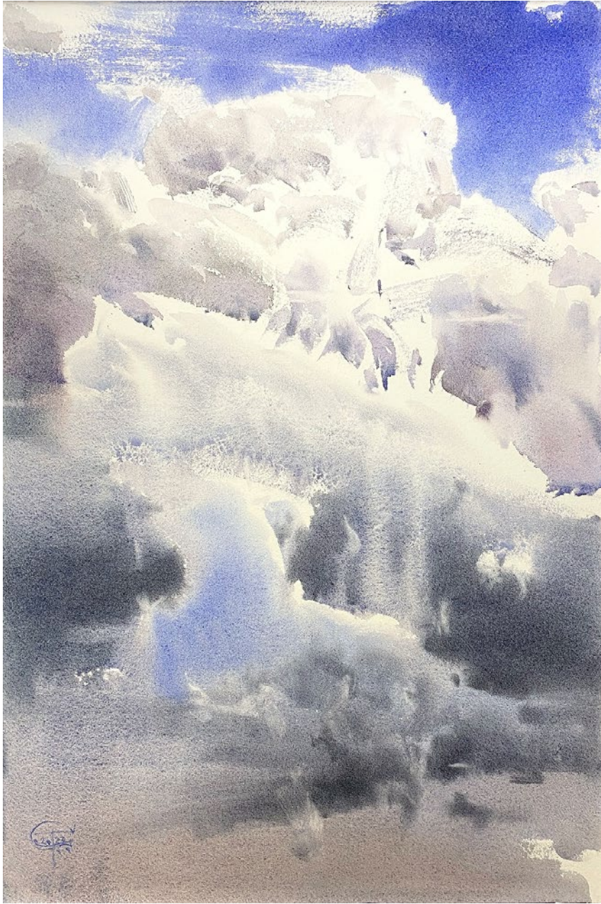
Pathway through the clouds – III. Watercolor on paper. 56 x 38 cm. 2023