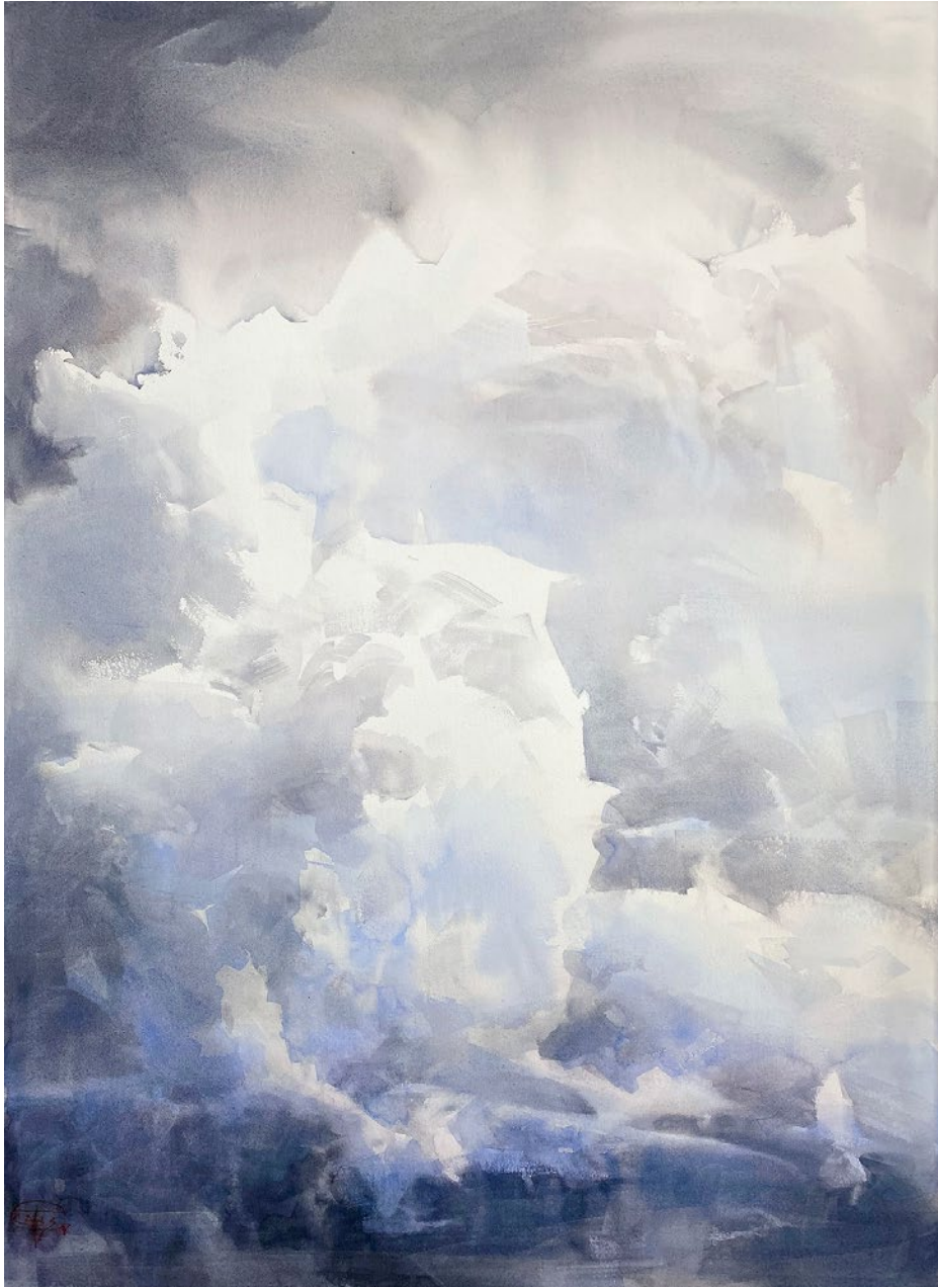
Heavenly Scapes. Series III. Opus XXIII-XII. Watercolor on paper. 76 x 56 cm. 2023