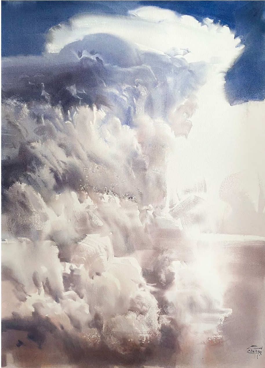
Heavenly Scapes. Series III. Opus XXIII-X. Watercolor on paper. 75,5 x 55,5 cm. 2023