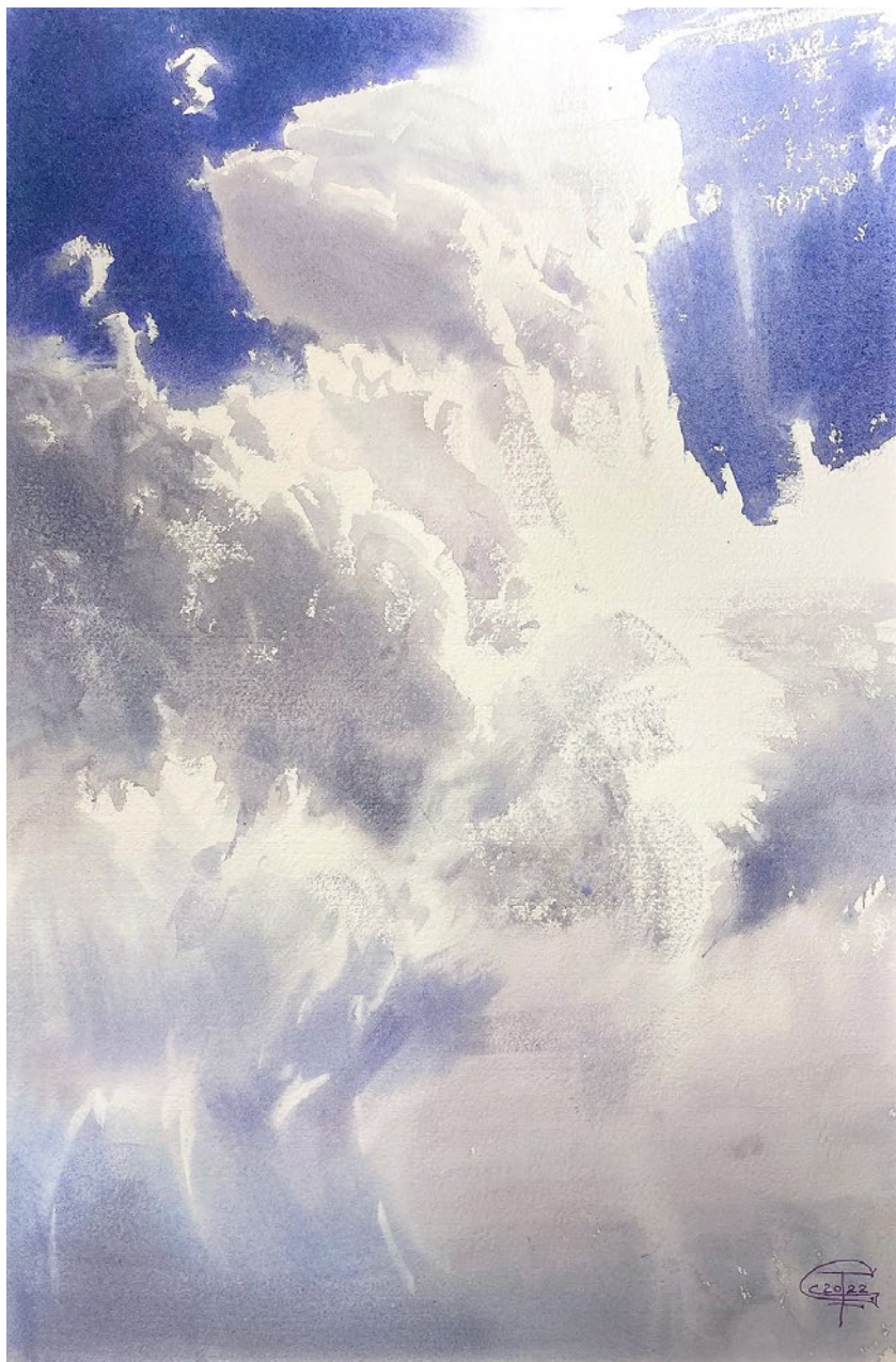
Pathway through the clouds. Watercolor on paper. 55,5 x 37,5 cm. 2022